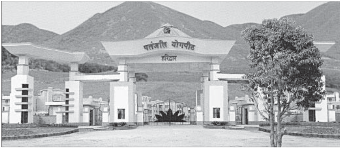
Pathanjali Yog Peeth in Haridwar, which will serve as a model for the proposed Houston center.